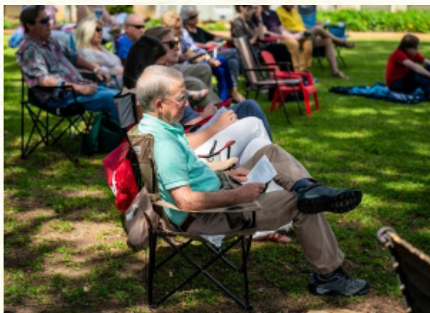
Service on the lawn, April 27, 2022

Trinity United Methodist Church 729 Paul Bryant Drive Tuscaloosa, Alabama 35401 (205) 759-4206